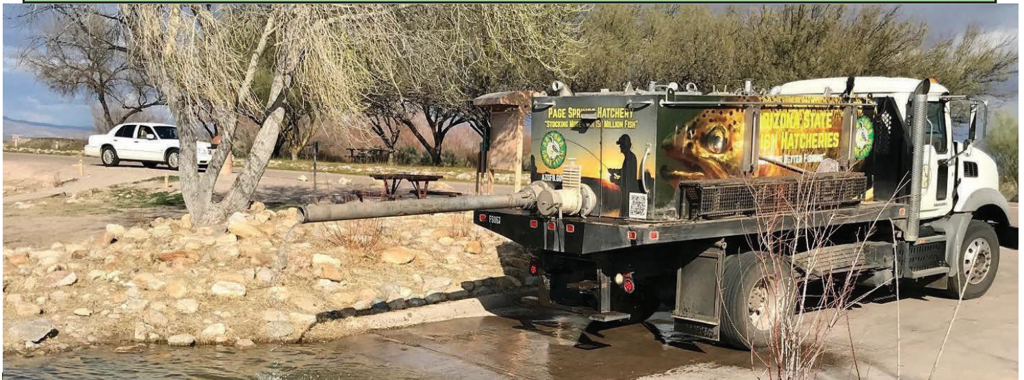
VERDE RIVER GREENWAY SNA

Dates are subject to change depending on weather, water quality, road conditions, and fish availability. Stocking will occur on the week of the dates listed, not necessarily on the exact day.