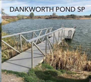
DANKWORTH POND SP