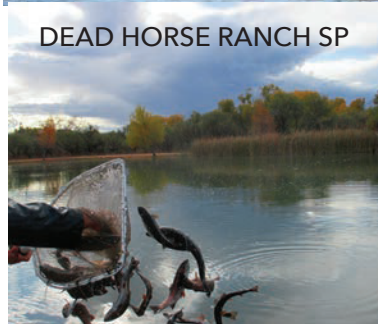
DEAD HORSE RANCH SP