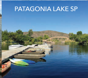
PATAGONIA LAKE SP