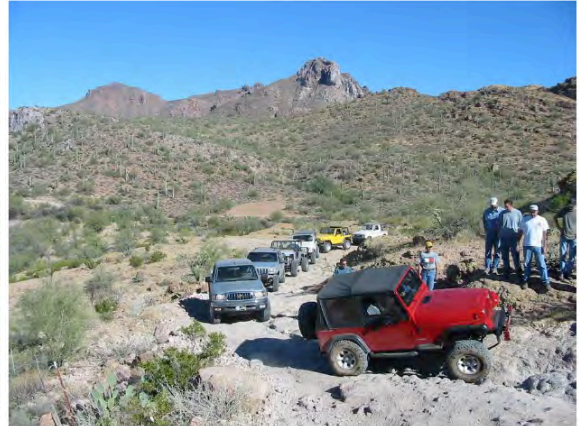
COKE OVENS TRAIL

Pinal County Sheriff's Deputies are experiencing an influx of 9-1-1 generated calls for service in the Public Lands areas. Due to this influx the Pinal County Sheriff's Office has created a Range Unit to deal with the issues of the Public Lands, OHVs and Grazing Range. This unit will utilize a 3-step program to help combat the issues we are now faces with.