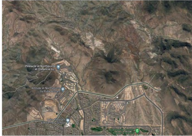
North of the Vistancia Community