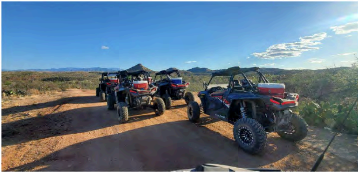
BACKSIDE OF MT LEMMON/ORACLE AREA