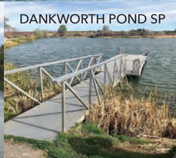
DANKWORTH POND SP