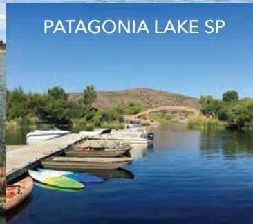
PATAGONIA LAKE SP