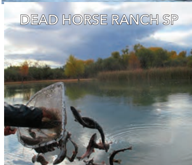
DEAD HORSE RANCH SP