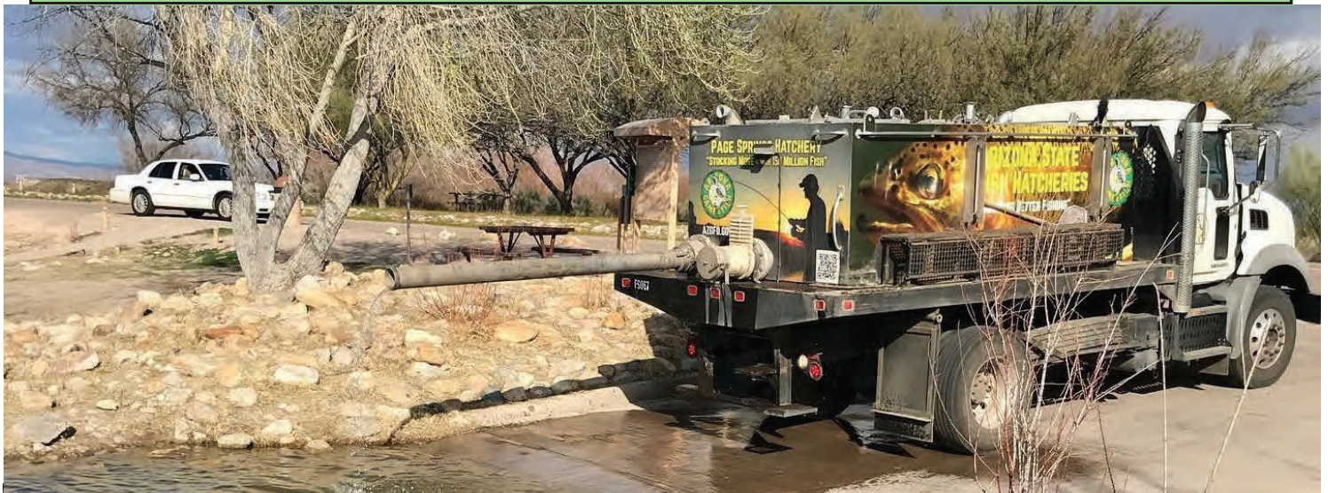
VERDE RIVER GREENWAY SNA