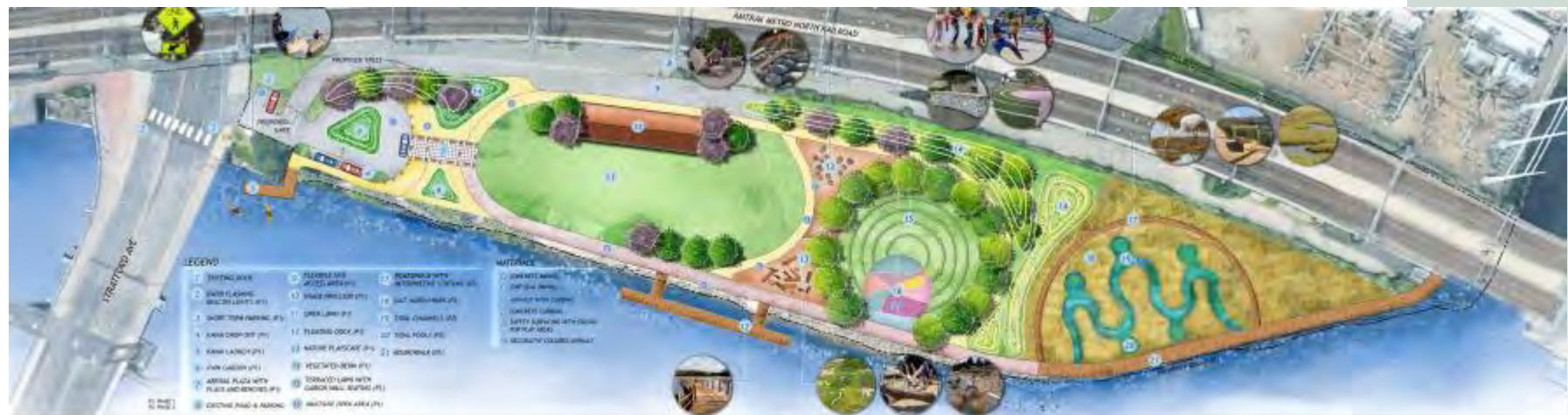
SITE PLAN SLIVER BY THE RIVER BRIDGEPORT, CT