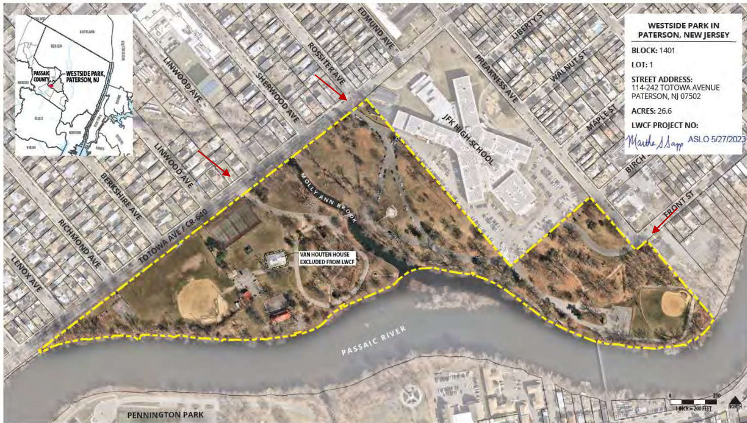
LWCF Park Boundary Map