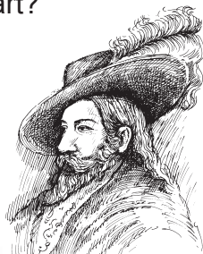
Juan Bautista de Anza

Did you know? The grindstones around the park are called molinos and they were used to grind corn.