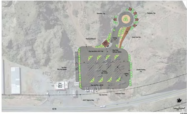
RIVER ISLAND OHV TRAILHEAD MASTER PLAN