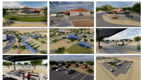
Bouse Staging Area - Perspective Renderings

The whole property has a 14,000 square ft. building, water, electric, a well and the infrastructure needed to maintain a park. These are a snapshot look at the proposed project. Nothing is set in stone. Possible cabins down the road along with tent camping sites.