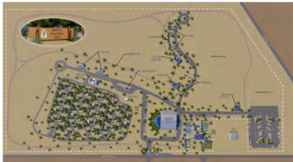
Bouse Staging Area - Plan View Rendering

MR. EBERHART: (Shows map of the proposed staging area in relation to the highways, AZ Peace Trail, elementary school, CAP, and nearby towns.) The main thing we wanted to bring forward to you (OHVAG members) is a discussion/to present to you the findings of the master plan. We worked with J2 engineering to create a draft master plan. The staging area has 40+ campsites with electrical, 2 restroom shower buildings, a secure staging area, trailer cleanout station, water fill station. The project originated as just a secure staging area for people to be able to offload their OHVs and go ride, knowing that their tow vehicle was safe in a secure parking lot and has grown since then to what it is today and this is a snapshot look at the proposed plan. Again, this is going to be a phased project done over time and we do have some preliminary numbers to share with you as well.