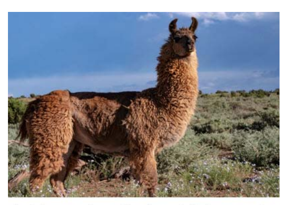
Annabelle, a current rescue llama in search of a home, poses for a photo.

Pursue your interests. Rewarding volunteer opportunities will open up with little effort.