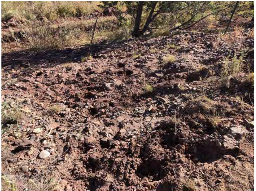
Holes dug by neighboring company at the site