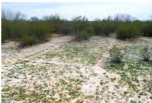
Spring vegetation reveals buried walls.