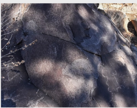
A major concentration of petroglyphs on a rock panel. Look closely and find a triangle shape scratched onto the panel.