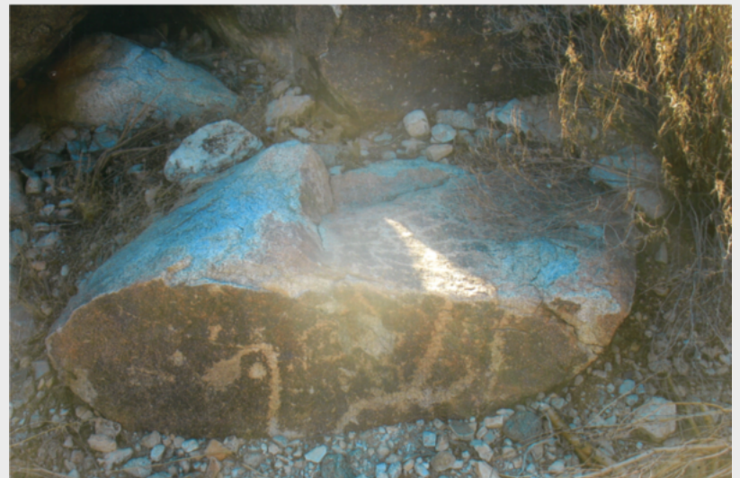
Petroglyph Plaza Solstice Event June 21, 2003