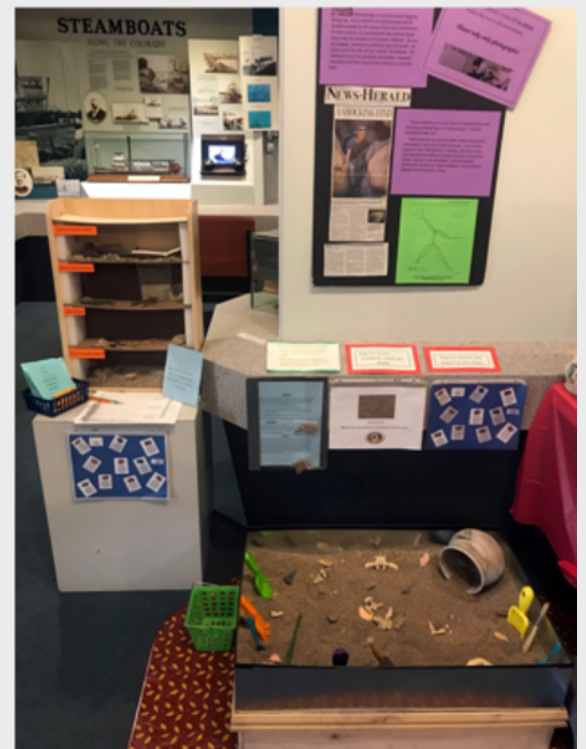
Summer Archaeology Exhibit