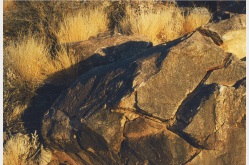
Petroglyph Plaza Solstice Event June 21, 2003

Another location in the White Tank Mountains Park with a solstice event is a site called the Petroglyph Plaza. The following photos show that event in different years. Here a shaft of light crosses thru a petroglyph on the top of a flat boulder.