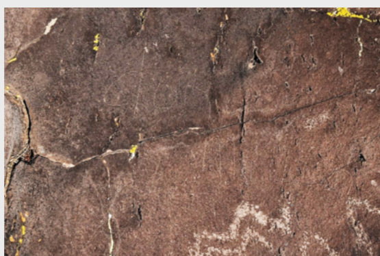
A name carved into a petroglyph panel near the main Waterbird Site.