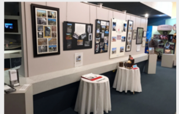
March Swansea Exhibit

We also partnered with our local museum. In March, we prepared a historic archaeology exhibit, and also set up a hands-on archaeology display as part of the summer-long Kids Summer Program. On July 26, we had a special program (partnering with First Things First) for preschoolers, including making scratch art "glyphs" and using a metate to grind mesquite.