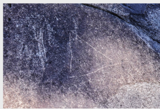
A close up of the vandalized rock panel with a triangle shape scratched in.