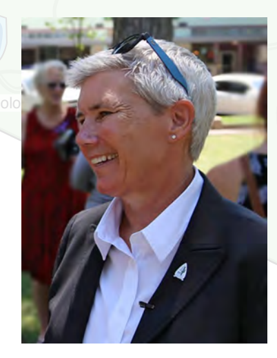
Governor Doug Ducey

Arizona State Parks and Trails has implemented the AMS system plan so that we may prioritize what matters most, and continually assess and adjust our direction in response to a dynamic external environment. Each of these initiatives reflects our optimism and dedication to our park's bright and sustainable future.